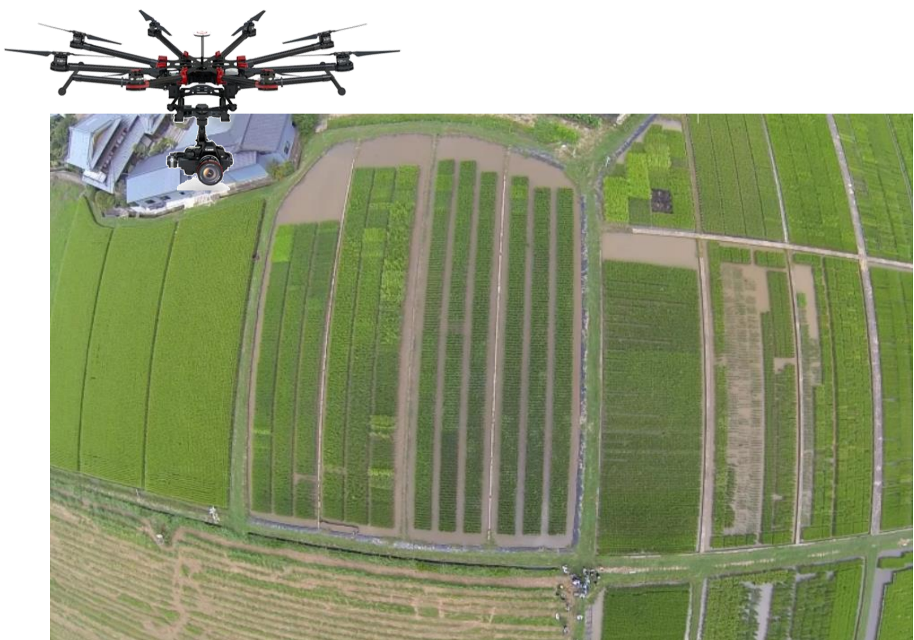
Agriculture Crop Monitoring Using UAV