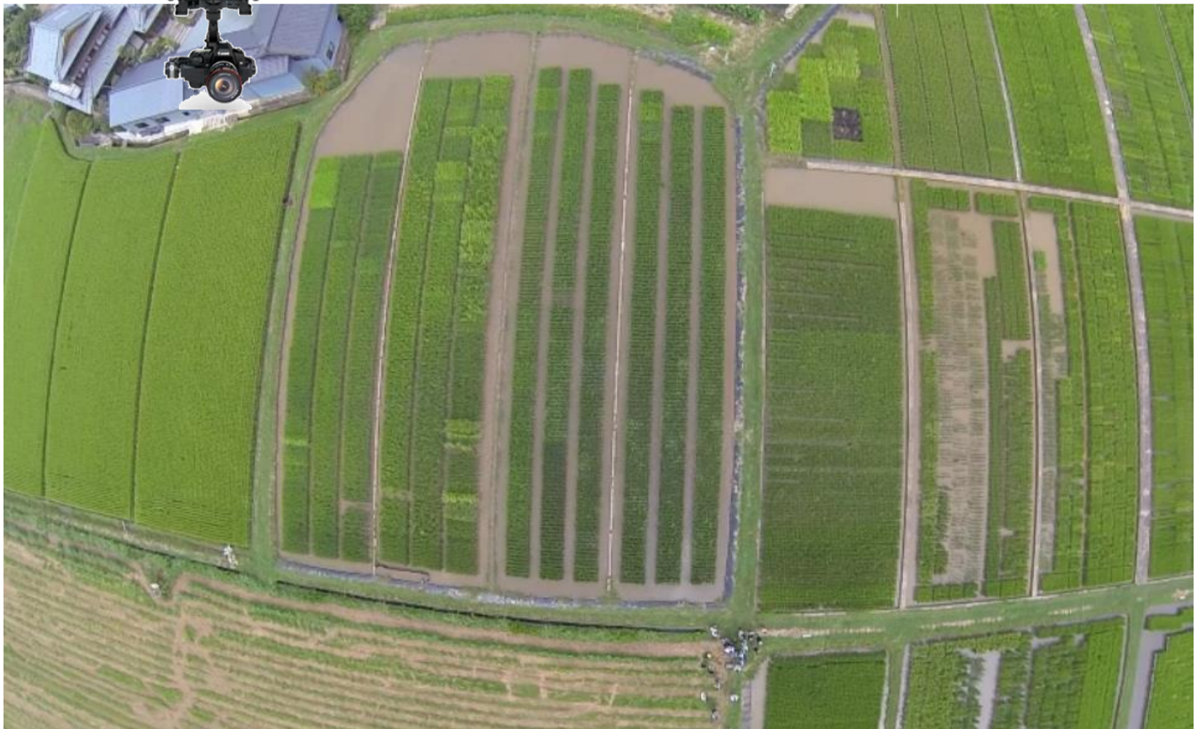
Agriculture Crop Monitoring Using UAV